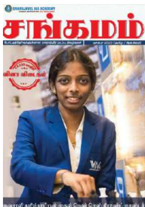
TNPSC Current Affairs SANGAMAM