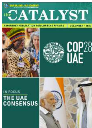
UPSC Current Affairs THE CATALYST