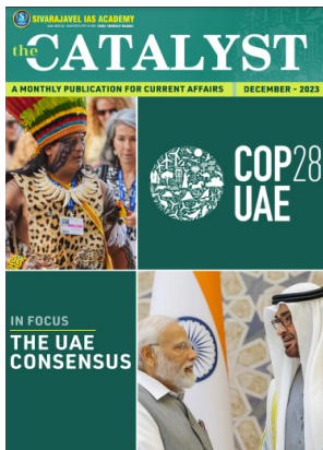
UPSC Current Affairs THE CATALYST