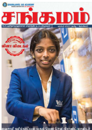
TNPSC Current Affairs SANGAMAM