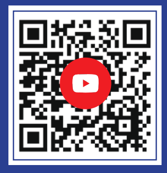
CLICK HERE FOR TOPPER'S TESTIMONIALS